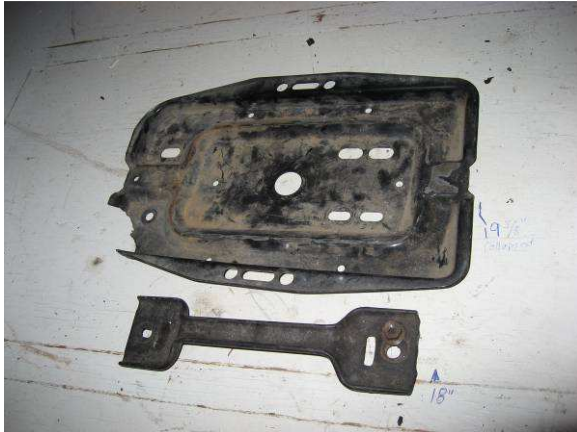
Battery pan & top handle fits 97- 2003 TJ Free

Call Ron Webber 714 649 9836 webbermail@cox.net