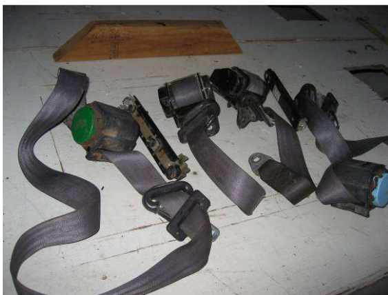
seat belts fits 97- 2003 free

Call Ron Webber 714 649 9836 webbermail@cox.net