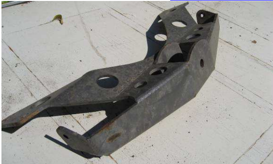
Rear Axle Bridge